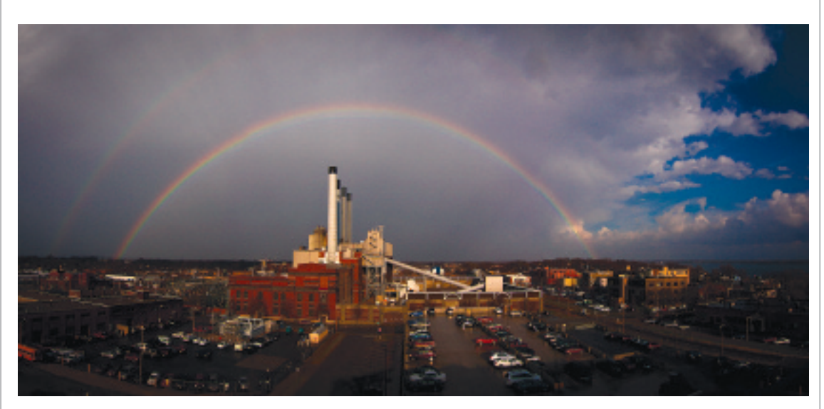
Madison, Wis.'s Blount Street plant is operated by members of Local 2304.

s utility companies face new deadlines for coal-fired power plants to comply with tight new EPA clean air regulations, many energy suppliers have plans to shutter plants that employ thousands of IBEW members rather than invest in costly upgrades.