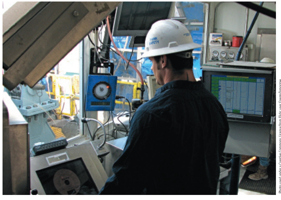
Massive shale gas deposits exist in more than 14 states, with active drilling going on in the Midwest, West and South.

The shale gas revolution is also being credited with stimulating the economy as a whole, experts say. Greater supply caused natural gas prices to plummet by nearly 40 percent between 2008 and