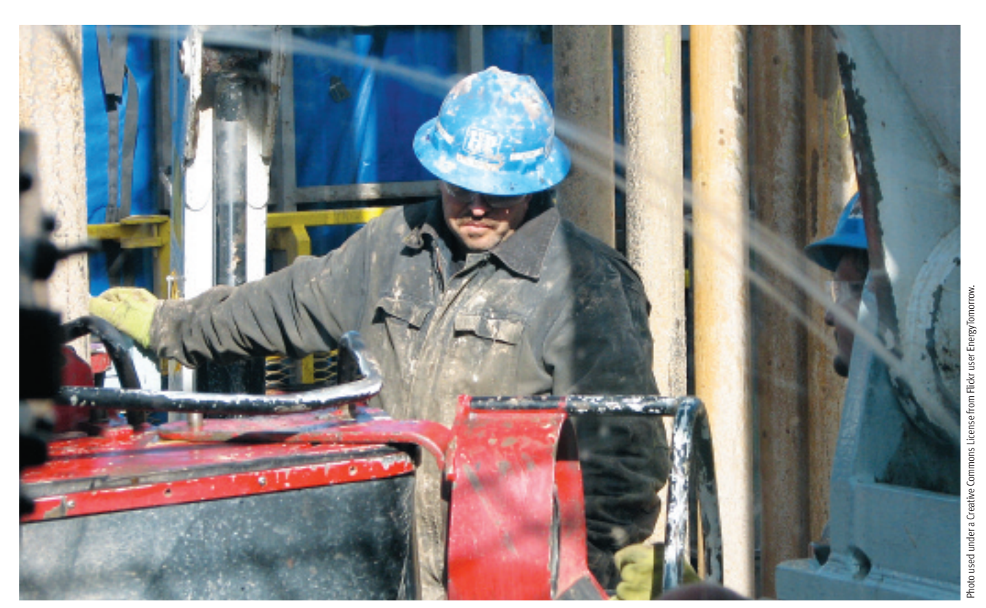
The rapid growth of hydraulic fracturing—known as fracking—is changing the energy map of the United States, creating tens of thousands of new jobs.

illiamsport, Pa.—Mud-splattered Ford F-150 pick-up trucks equipped with full tool boxes fill the parking lots of nearly every hotel, motel, bar and restaurant in Lycoming County, sporting license plates from across the country. Workers from Arkansas, Texas, Florida and