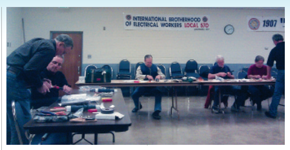
IBEW Local 570 members attend high voltage splicing class.