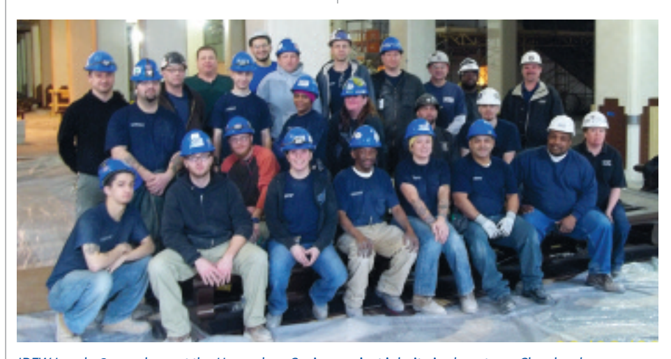
IBEW Local 38 members at the Horseshoe Casino project jobsite in downtown Cleveland.